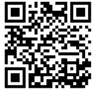
image: direct link to the feedback form

If there is something we should address right now, the person to tell is your cruise director .